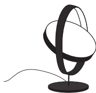
table lamp black