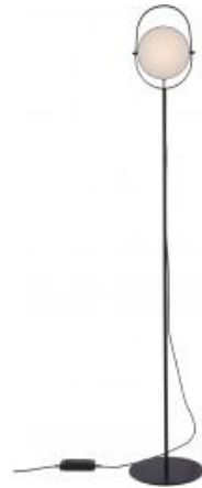
WALL LIGHT RED