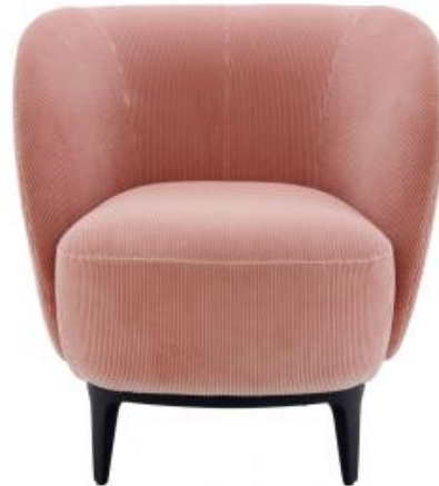
ARMCHAIR COMPLETE ITEM